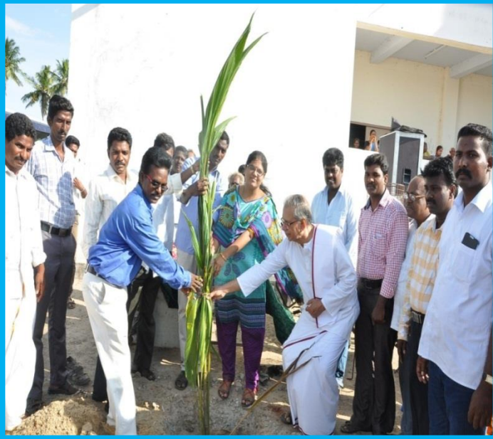
OfERR FOUNDER and Revenue Development Officer of Chidabaram planting trees