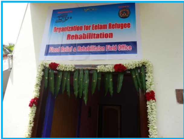
FLOOD RELIEF AND REHABILITATION BRANCH OFFICE opened in MAY 2016 in Chidambara, CUDDALORE