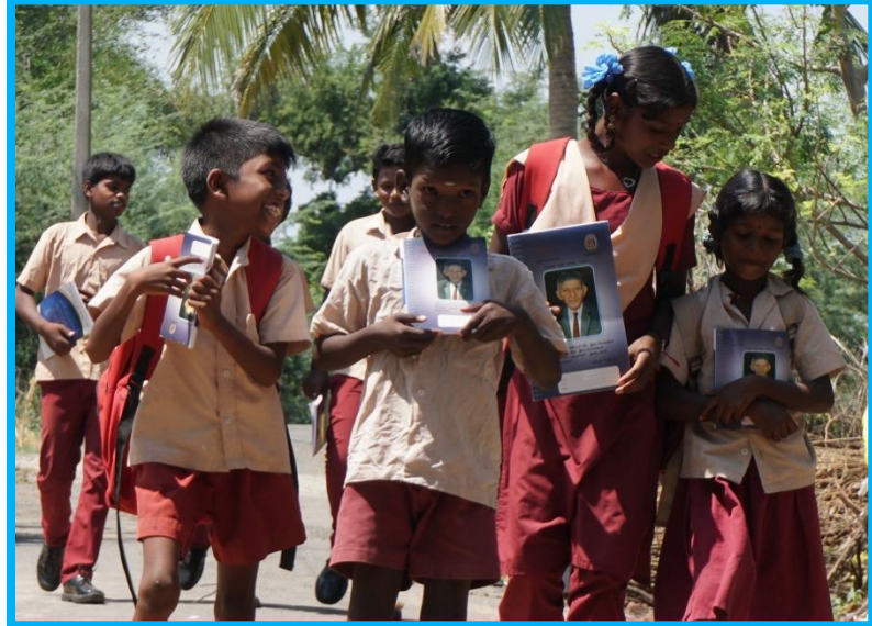
Students walking to tuition Center with their FREE NOTEBOOKS