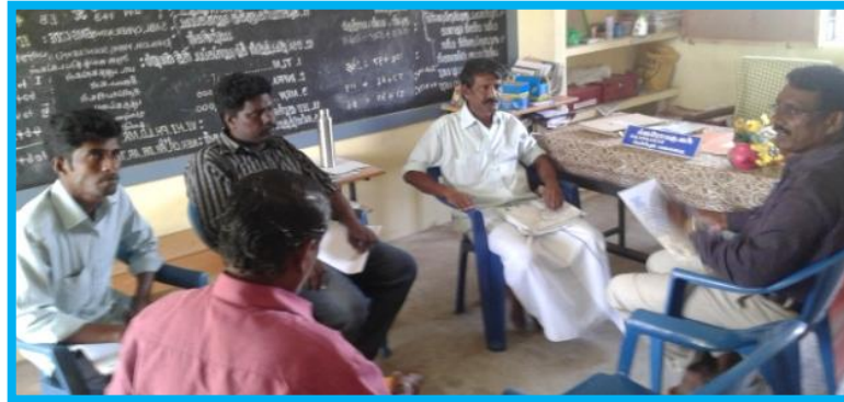
OfERR education staff Mr. Sarvanan discussing with Government teachers about education programs to implement for the village children