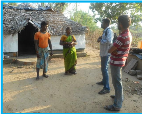
Agaram team and OfERR staff conducting home visits