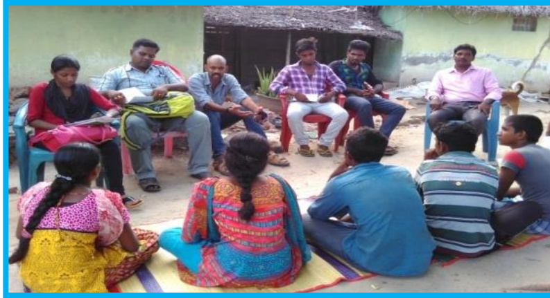
Agaram team and OfERR identifying drop-out students in each village