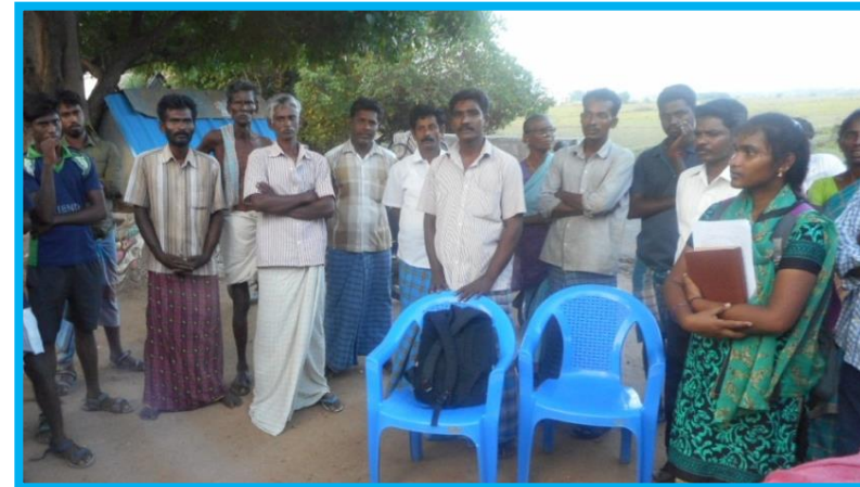
Agaram team and OfERR meeting with the parents and village leaders